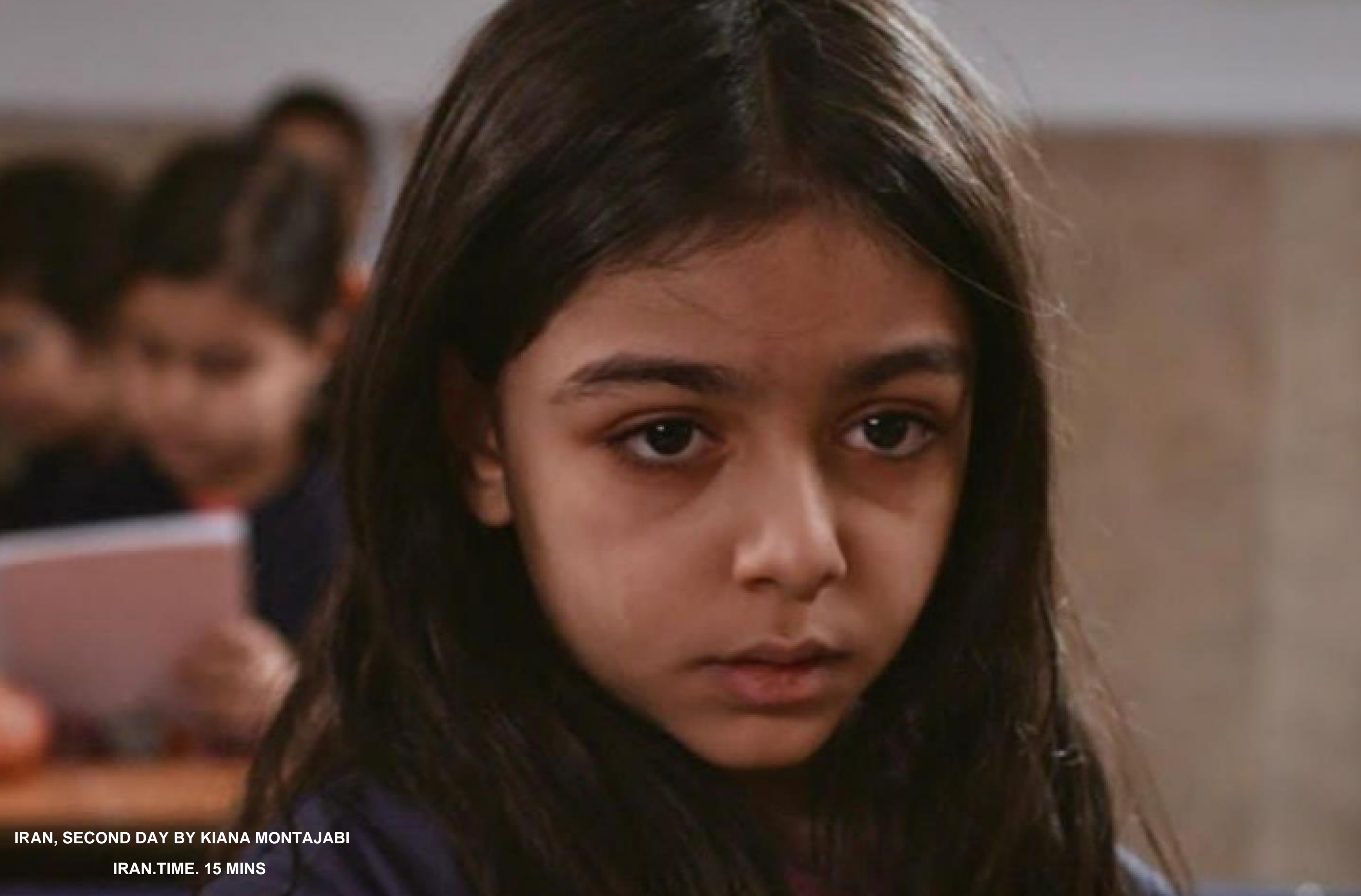
IRAN, SECOND DAY BY KIANA MONTAJABI