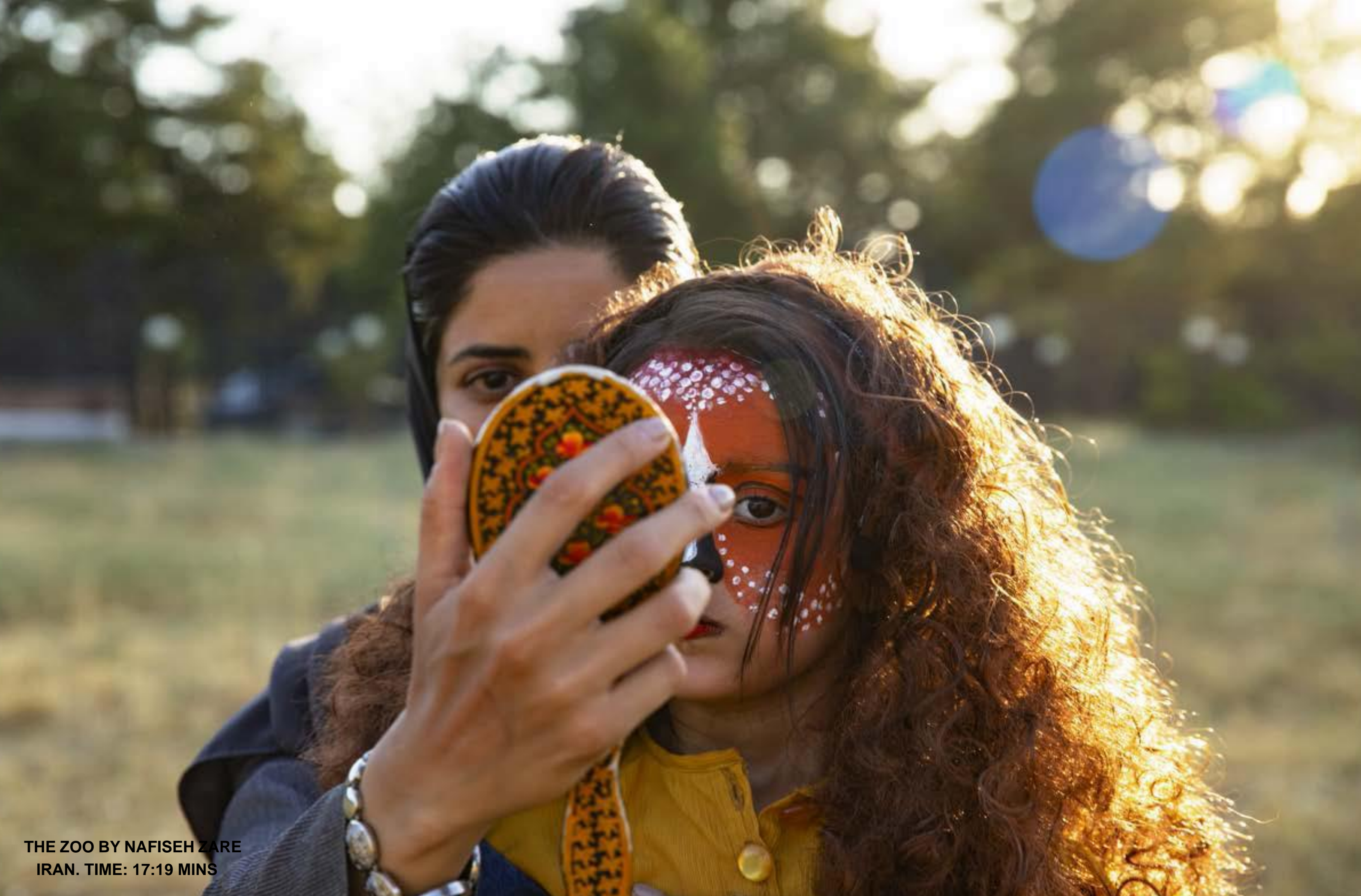
THE ZOO BY NAFISEH ZARE IRAN. TIME: 17:19 MINS